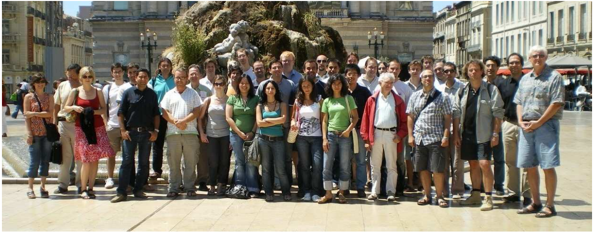
Figure 1: SIPTA School: A happy group of participants at the Place de la Comédie, Montpellier.